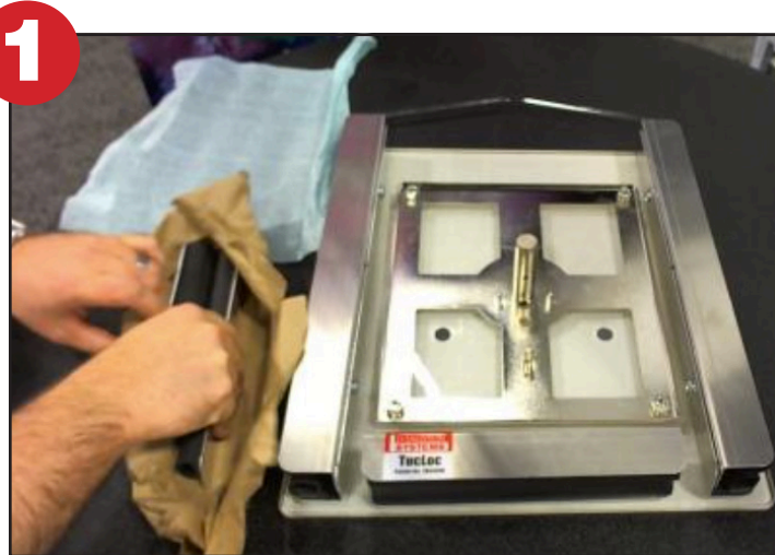
Step 1: Remove the protective wrapping from Gripper Channels.

Below are instructions for installing the Adult Gripper Kit on a Brother DTG Printer Platen. The same steps apply to installing gripper kits on Youth and Oversized Platens, but the size of the Gripper Channels will all be the same and not overlapping as on the Adult Platen.