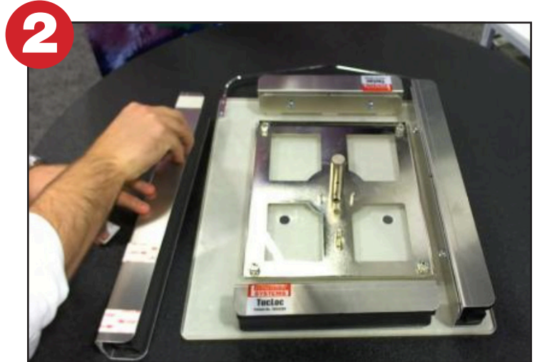
Step 2: Remove the backing from the adhesive foam tape.